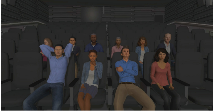
Fig. 3. Screenshot of the full audience.

26,7 answers per input condition. For compiling the results, we used a majority voting to determine the perceived state of a particular video, e.g. if the audience of one video was rated with an arousal level of 5 by 4 participants and with an arousal level of 3 by 2 participants, then the video receives a score of 5. When a tie occurs, the scores are averaged for the video. The results, averaged over all input videos, are presented in Fig. 4.