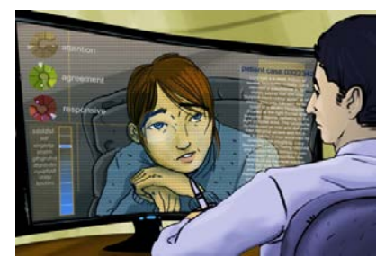
Figure 1. SimSensei virtual health agent (on left) and Telecoach interface concept (on right)

ing risk factors associated with depression or PTSD. MultiSence will fuse information from web cameras, Microsoft's Kinect and audio processing to identify moment-to-moment opportunities to provide supportive feedback (as in [15]) and to identify the presence of any nonverbal indicators of psychological distress.